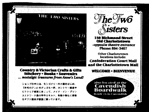
Figure Five Ad for The Two Sisters Store, Charlottetown

ries" (see figure six). The "Anne merchandise" is supplemented by the kind of products one would find in any country store: wooden figurines, pewter frames, jewellery, maple syrup, pottery made by local potters. No doubt this supplementation helps contextualize the Anne Store within the country store genre. All products are displayed, for the most part, in appealing, carefully-designed spaces. The store's interior is predominantly glass and wood, in-