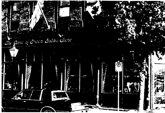
Figure Three Anne of Green Gables Store, Charlottetown

previous social formation" (415). To illustrate a "residual culture," Williams uses the example of the "very significant popularity," in Britain, "of certain notions derived from a rural past" (415). Williams emphasizes the point that although "a residual culture is usually at some distance from the effective dominant culture ... it may get incorporated into it" (415-6). British tourism's appropriation of Kenneth Grahame's pastoral world of The Wind in The Willows to promote travel to the English countryside seems exemplary of Williams's notion of "residual culture." In North America, the recent phe-