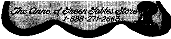
Figure Two Website banner, © Anne of Green Gables Store, Charlottetown, PEI, http://www.peionline.com/anne/

cautiously, partially overcome, I do not bring up the above points out of defensiveness, but rather to posit a space of rich intersection between the comprehensive entity known as “popular culture” and one of Canada’s best-known women writers and children’s authors, Lucy Maud Montgomery. Although I suspect that studying popular culture expressions of Montgomery’s work has few new insights to offer on the work itself, I believe it nevertheless articulates, in meaningful ways, messages about desire in contemporary consumer culture. The discussion that follows does not pretend to decode all these messages; it offers only a starting point, and as such, it excludes a considerable amount — the televised and theatrical adaptations of Montgomery, for example — in order to examine several strategies used in marketing the Green Gables mythology within the larger context of contemporary consumer society.