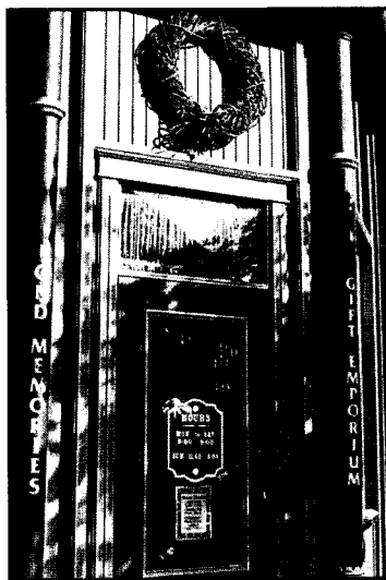
Figure Six Entrance, The Anne of Green Gables Store, Charlottetown

ries" (see figure six). The "Anne merchandise" is supplemented by the kind of products one would find in any country store: wooden figurines, pewter frames, jewellery, maple syrup, pottery made by local potters. No doubt this supplementation helps contextualize the Anne Store within the country store genre. All products are displayed, for the most part, in appealing, carefully-designed spaces. The store's interior is predominantly glass and wood, in-