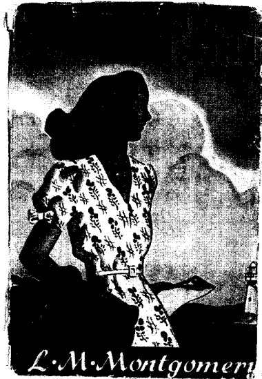
Figure One Cover design by Stanley Turner for the 1937 McClelland & Stewart edition of Jane of Lantern Hill

Green Gables mythology is of an intensely aestheticized, sentimentalized, and intertextual nature.