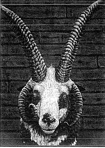
Illustration from A Barnyard Bestiary